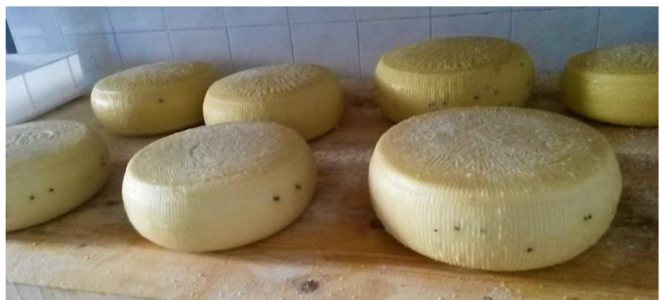
Processed products: Horse beans from Claudio Scillirò's farm in Maletto and pecorino cheese from Mazzurco's farm in Bronte