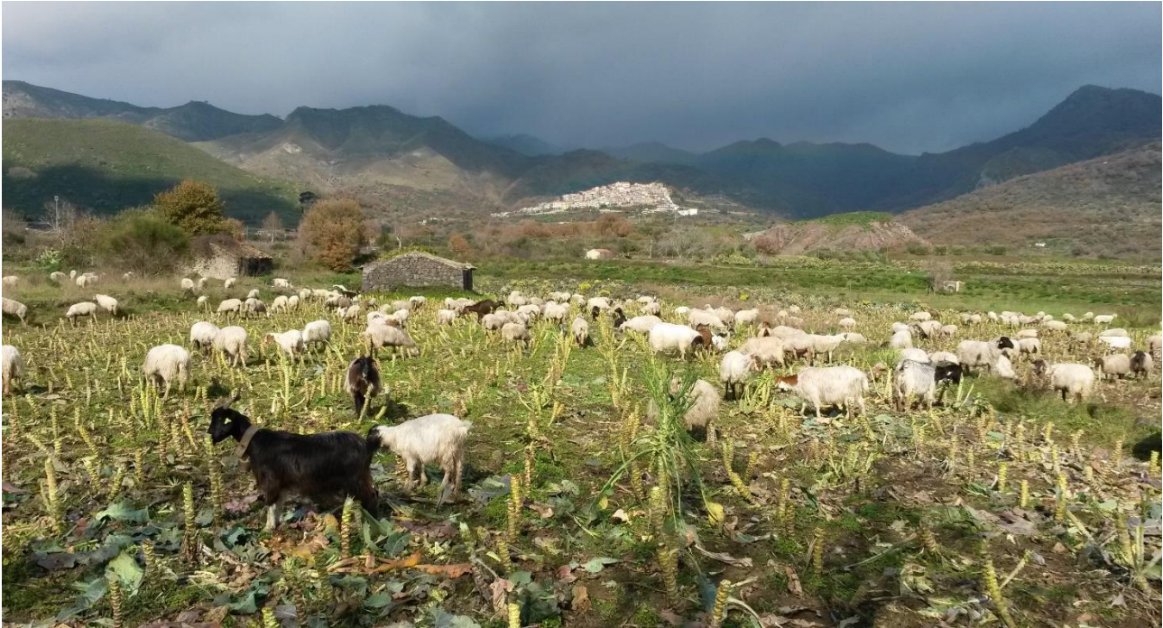
Sustainable double use of a cabbage field in Moio Alcantara