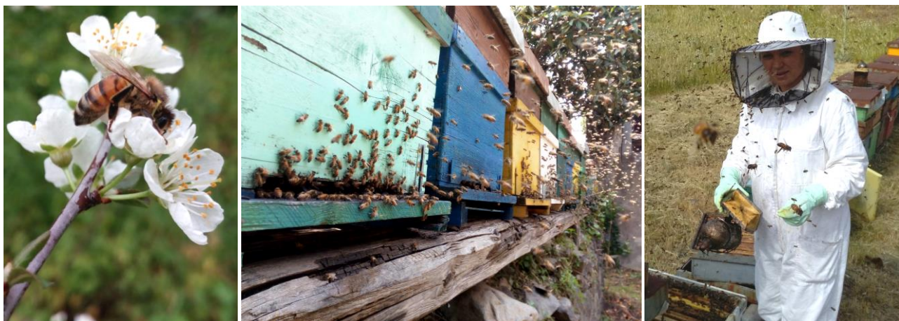
Details of the Guma natural farm, which deals with beekeeping and obtained CAP funds for the purchase of bee houses, with a contribution of 60% of the cost

Currently, the team from the University of Catania is finalising the report on the results of the audits on farms and the multipliers are finalising the last farm visits.