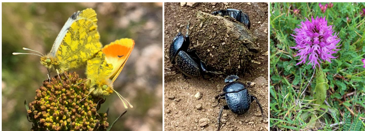
Agriculture land biodiversity: Anthocharis damone , Scarabaeus variolosus , Orchis italica